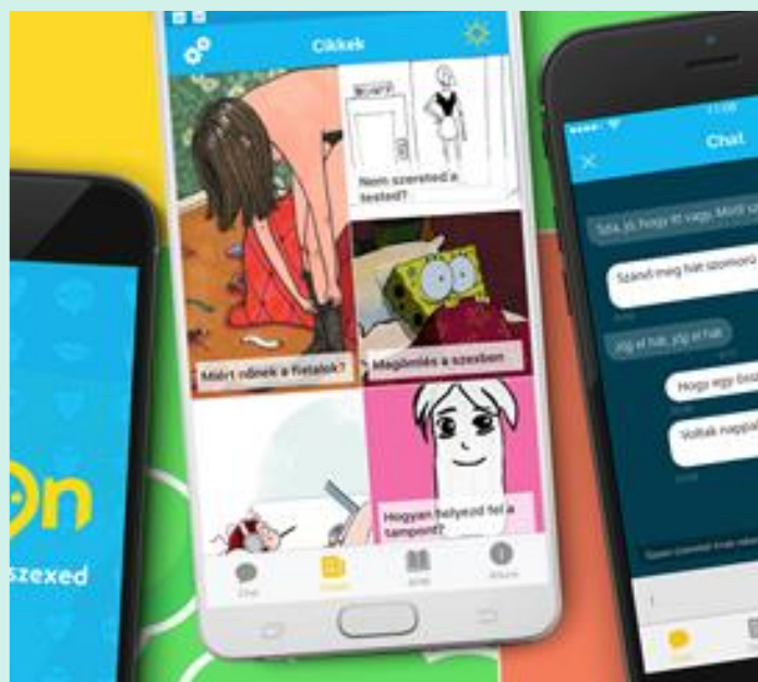
The Yelon page offers a desktop and mobile version