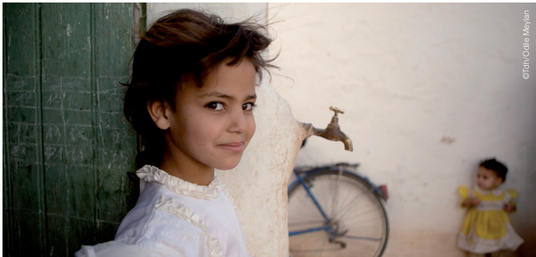
Terre des hommes combats child exploitation, for example in the case of “little maids” in Morocco.