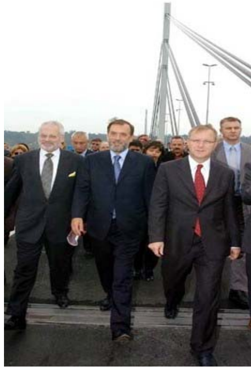
Special Co-ordinator Erhard Busek with Minister of Foreign Affairs of Serbia and Montenegro Vuk Draskovic and European Enlargement Commissioner Olli Rehn walking across Sloboda Bridge

Among others, 2005 also saw the inauguration in October of the Sloboda Bridge in Novi Sad, which was destroyed in the 1999 NATO raid. Funds for the reconstruction of the bridge were secured in 2000, when the first list of regional infrastructure projects (Quick Start Projects) was prepared. Ever since 2000, the Stability Pact had been campaigning for a more efficient use of the Danube as a transport waterway, and had been promoting the consideration of projects that would make use of the Danube's potential as an environmentally-friendly transport mode. The 40 million euro reconstruction was financed by various international donors, including the European Agency for Reconstruction.