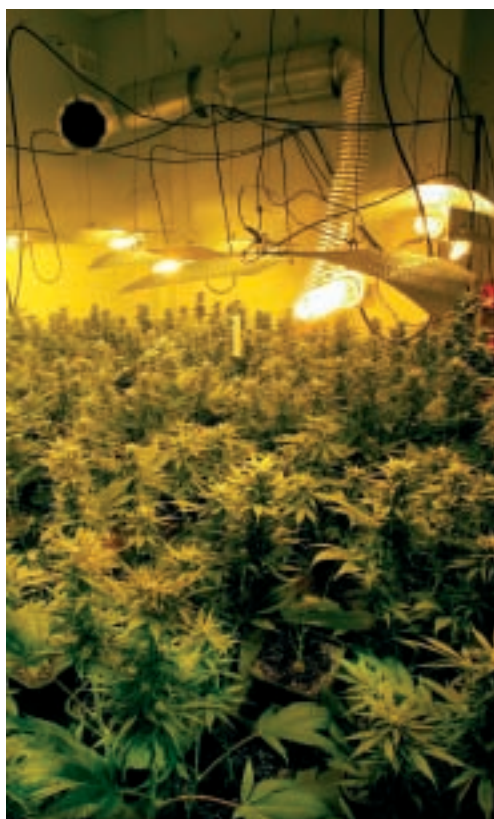
A cannabis factory in the UK where children trafficked from Viet Nam worked.