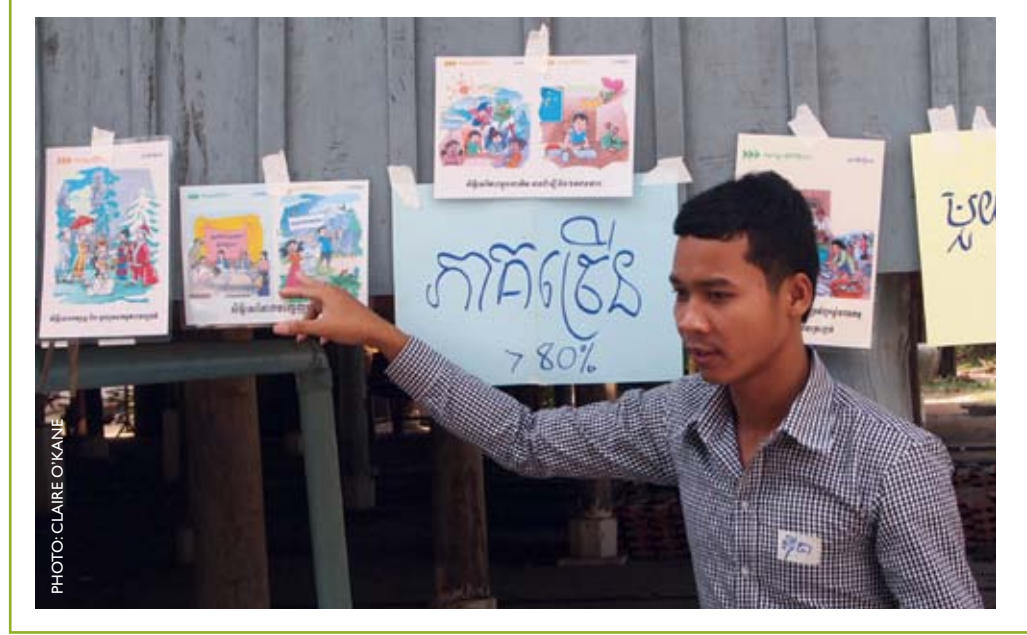
A young facilitator in the CRSA process

In addition to developing a main CRSA report, the consultant produced a summary report for translation and sharing with children and adults who had participated in the CRSA process. Furthermore, building on the CRSA participatory process with further engagement by children young people, and groups led by them, networks and movements were planned to inform the development of the country strategic plan.