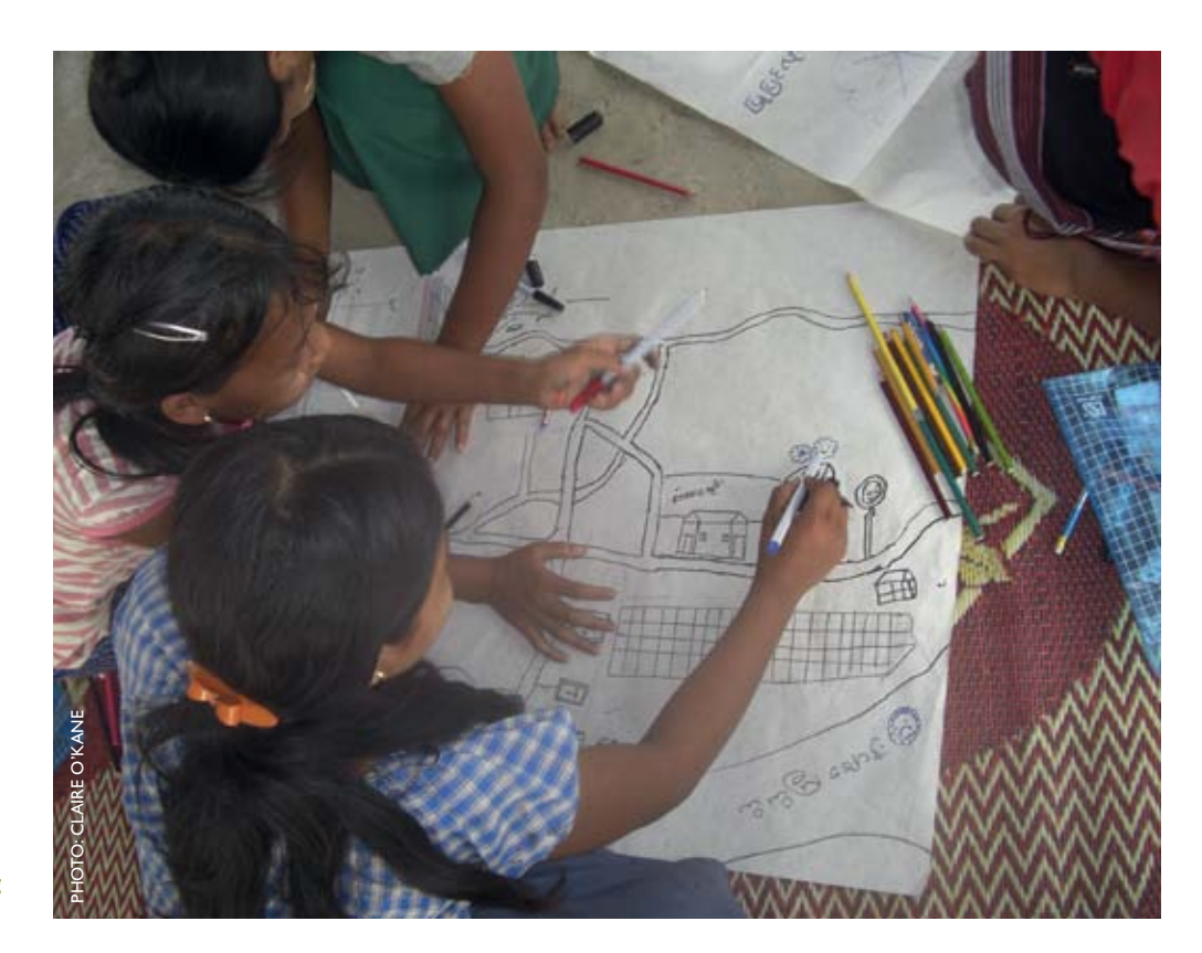
Children in Myanmar carrying out a risk-mapping of their community