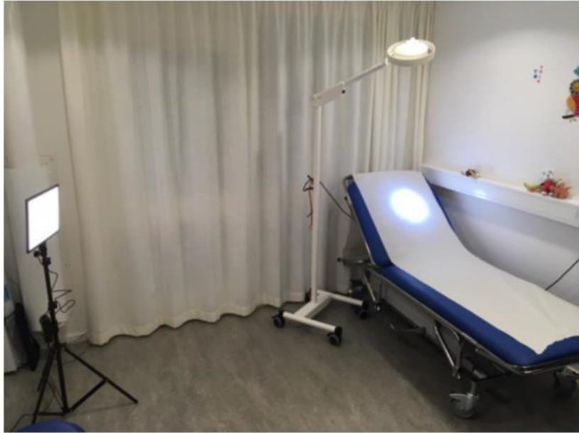
Medical Examination room, Barnahus Stockholm